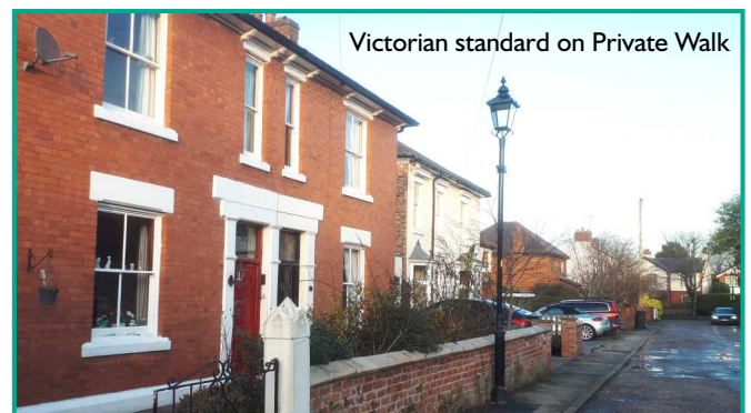
Victorian standard on Private Walk