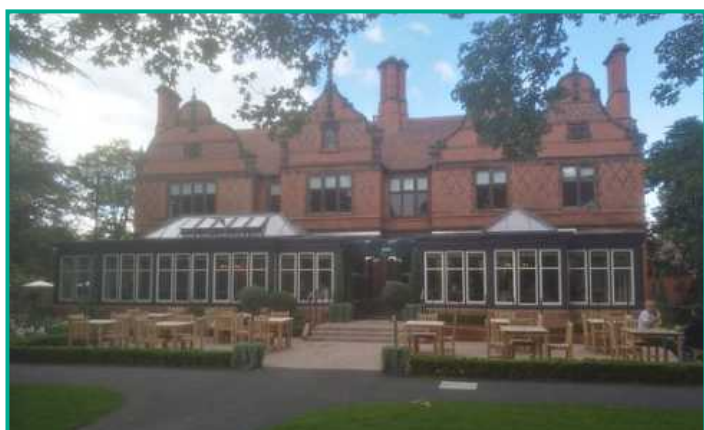
Oakfield House - Chester Zoo

This year saw far more nominations in the "Good" category than in the "Bad" and "Ugly" categories put together. The judging process involved a first for my 10 tenure as chair of the judging panel; the judges were in unanimous and vigorous agreement as to the project that should be the winner of the Chairman's Special Award. That winner was the renovation of Oakfield House at Chester Zoo. For those who haven't yet seen it, a trip to the zoo will be well worth it to see Oakfield and stop for a drink or a bite to eat. It is now a gastro pub that has been beautifully restored with breathtaking attention to detail and the addition of a conservatory (though that term does not do the extension justice) that is so good it looks as if it has always been there.