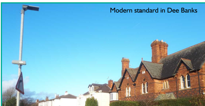
Modern standard in Dee Banks

A group of local residents is now trying to get the modern lights replaced by more traditional lamp standards. The houses on this stretch of Dee Banks are part of the Dee View Estate, a management body for the area dating from the 19th century. The Estate has recently replaced the lights on Letter Box Lane and Private Walk with traditional standards and these would be very fitting on Dee Banks as well. A modest partnership between the Council and the Estate to replace the lights would bring some real environmental quality back to this busy stretch of road.