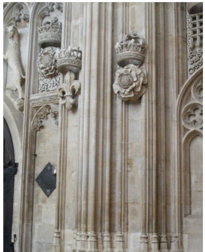
Inside King's College Chapel, the fleur de lys and Tudor rose can be seen. The Beaufort portcullis can be partially seen to the right of the photograph