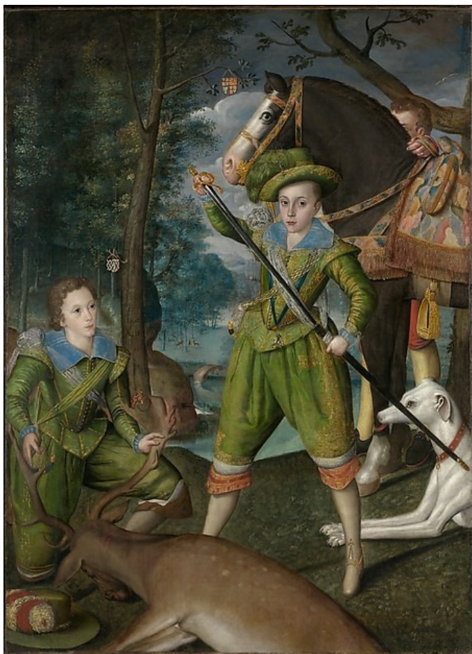
The young Prince Henry with Robert Devereux, third Earl of Essex by Robert Peake, 1605

Henry matured quickly and was aware of his status and significance as future king. In 1610 he was made Prince of Wales and Earl of Chester. With James' reign followed by Henry's the Calvinist clergy hoped for sufficient stability for the doctrines of the Anglican Church to be made less ambiguous, and Calvinist principles to become more intrusive in people's lives.