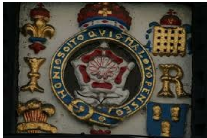
A panel outside Bishop Lloyd's Palace commemorating the Prince of Wales

The commemorative panel on Bishop Lloyd's Palace shows the optimism of the time. It celebrates the Stuart dynasty. The IR (Iacobus Rex) clearly places it within the reign of James I. The crowned Order of the Garter is central with its Tudor rose. The fleur de lys and the crowned gate take us back to the decorative armorial features of King's College Chapel. The fleur de lys giving hereditary links to the Plantagenets. The portcullis taking their line to Margaret of Beaufort and the Tudor Welsh links.