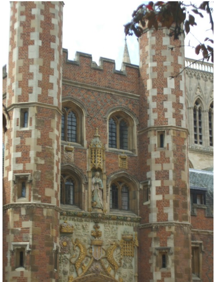
The exterior of St John's College. Margaret Beaufort is in a high niche. Her portcullis device can be seen as well as the Tudor rose

After gaining his MA he spent some time as a Fellow at Magdalene. There were advantages in this, and he would have financial remuneration.