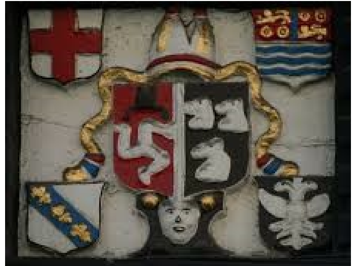
Panel on Bishop Lloyd's Palace, showing George Lloyd's arms as Bishop of Sodor and Man.

George Lloyd's arms, which he was entitled to use from 1600 to the end of his time as Bishop of Sodor and Man, are outside Watergate Street on this house. The house is called 'Chester House' in early documents. The house could certainly be regarded