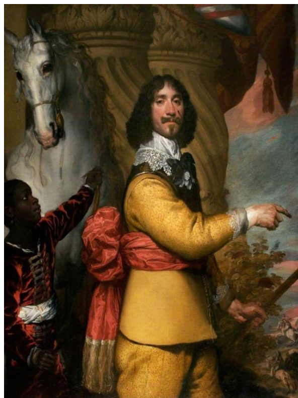
John Byron, 1st Lord Byron, by William Dobson c.1644.