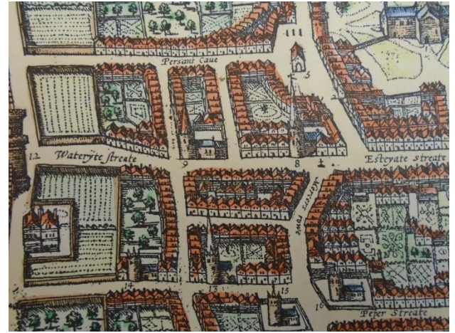
Map of Chester by Braun & Hogenberg

Clearly, at this point, the two houses subsequently known jointly as Bishop Lloyd's Palace, were still separate entities, lately in separate ownership, with gardens, kilns and stables at the rear, reflecting the still relatively undeveloped backlands behind all the main streets of the city as shown in Braun & Hogenberg's map of 1580. 17